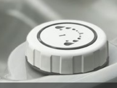
AIR & WATER DIVERTERS