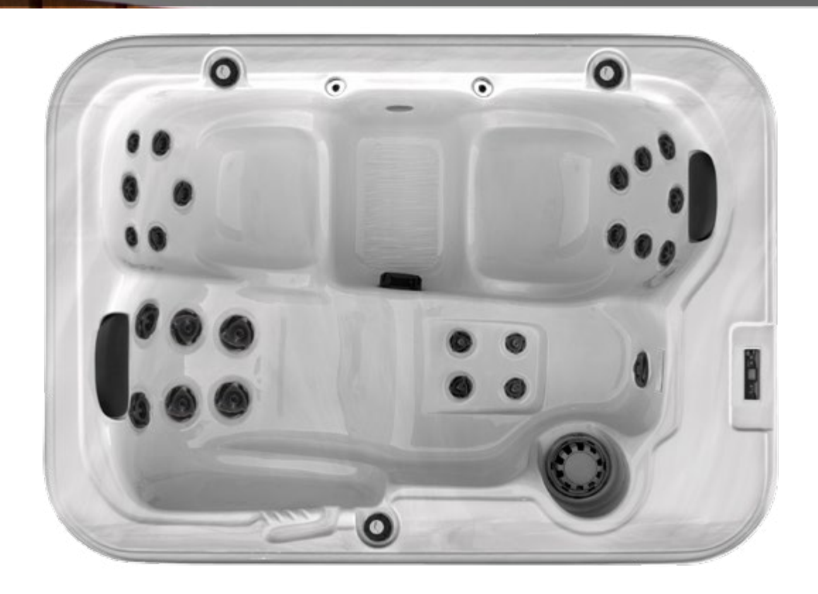
L524 HIDEAWAY SERIES