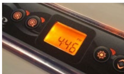
USER FRIENDLY, DIGITAL CONTROLS