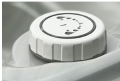
AIR & WATER DIVERTERS