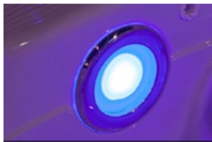
UNDERWATER LED LIGHTING