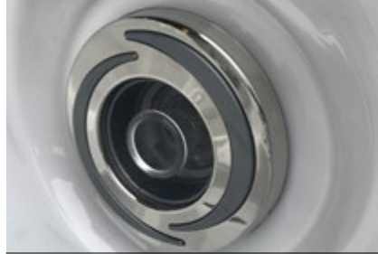
STAINLESS STEEL JETS