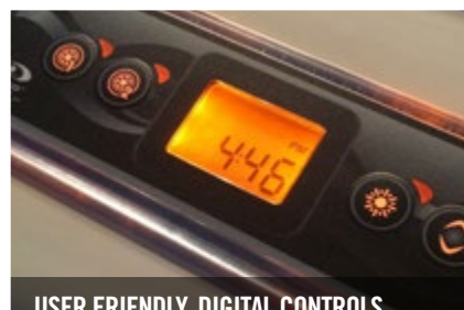
USER FRIENDLY, DIGITAL CONTROLS