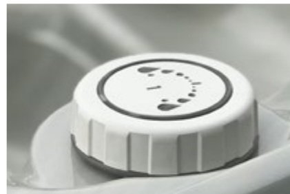
AIR & WATER DIVERTERS