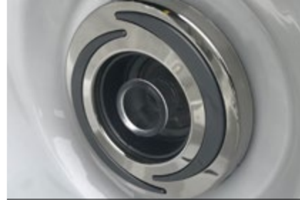
TWO TONE HYDROTHERAPY JETS