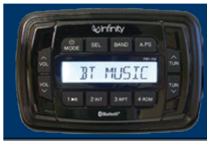
INFINITY™ AUDIO SYSTEM