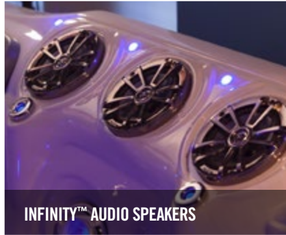
INFINITY™ AUDIO SPEAKERS