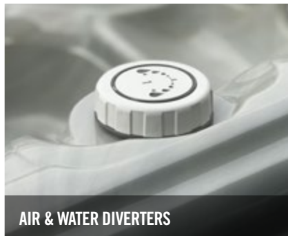
AIR & WATER DIVERTERS