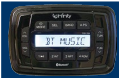
INFINITY™ AUDIO SYSTEM