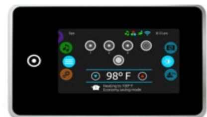
USER FRIENDLY, DIGITAL CONTROLS