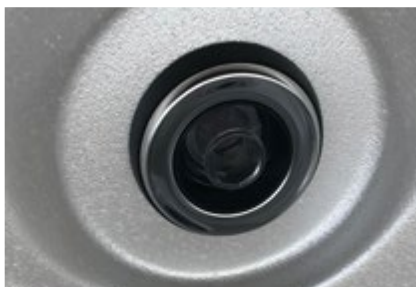
OPTIONAL JET COLOR PACKAGE