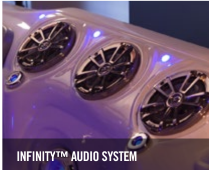
INFINITY™ AUDIO SYSTEM