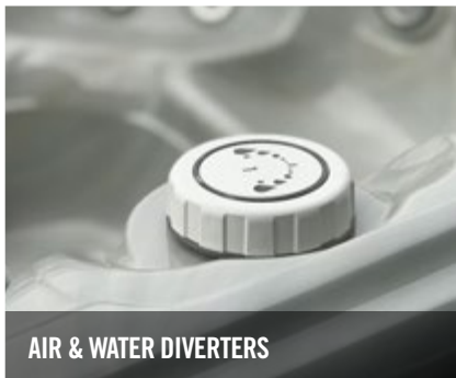
AIR & WATER DIVERTERS