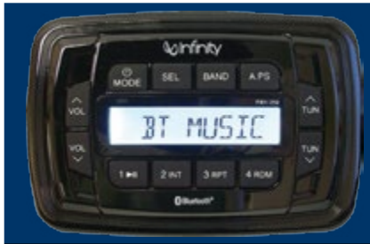
INFINITY™ AUDIO SYSTEM