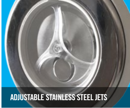
ADJUSTABLE STAINLESS STEEL JETS