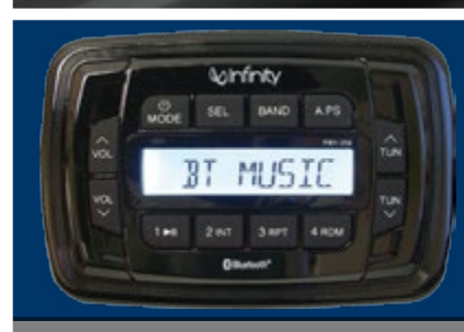
INFINITY™ AUDIO SYSTEM